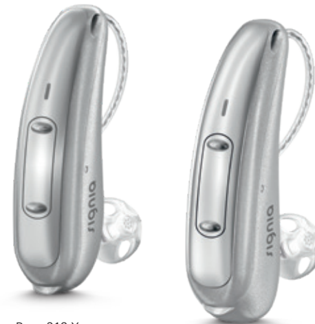
Pure 312 X

The new Pure 312 X delivers a powerful performance for an outstandingly personal hearing experience. All day long.