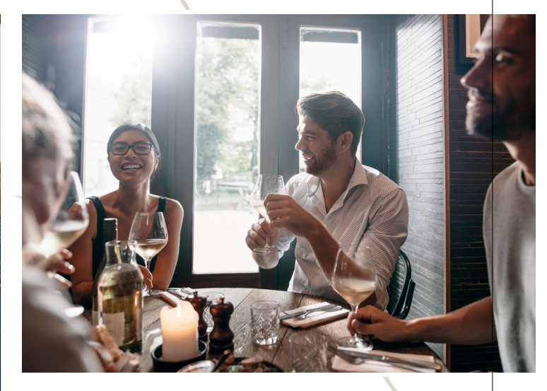
Comprehensively focused – G5 hearing systems automatically adapt to your conversational situation.

SpatialSpot — Life often has more than just one focus: in complex hearing situations, in conversations with business partners or friends, no one wants to miss anything. This is why the G5 technology focuses on your main conversational partner, yet still specifically allows other signals. As a result, you can fully concentrate on your conversation – and yet not miss anything which incidentally becomes particularly important.